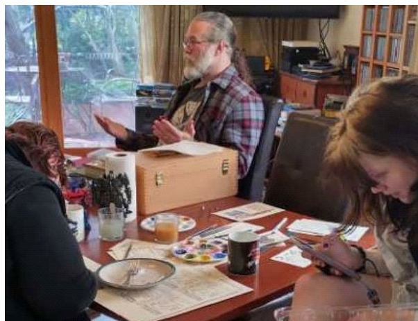
Calligraphy and Illumination Workshop, Aug 31 st