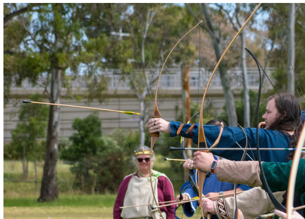
Lord Ronan loses a deadly shaft